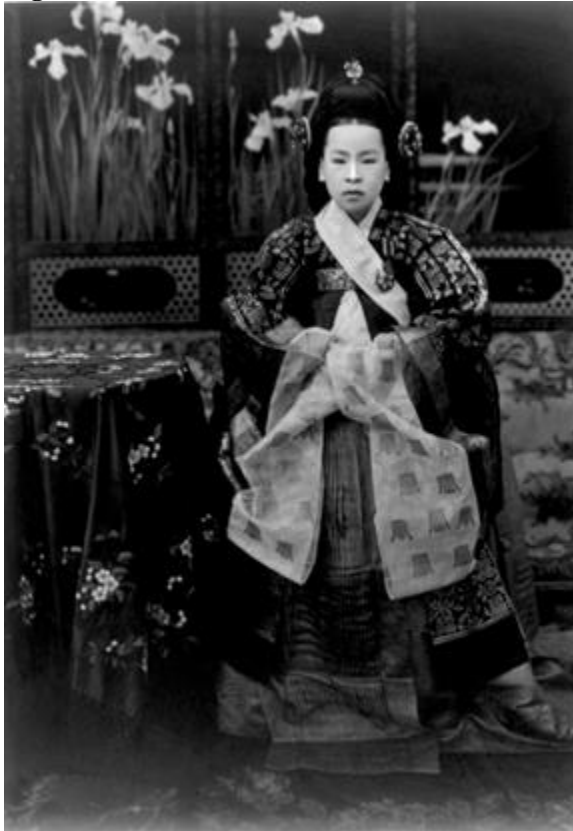
Queen Min.

With her dedication to Korean independence and her power over the Korean nobility, Queen Min was naturally the key obstacle to Japan’s efforts to consolidate control over the peninsula. From Japan’s perspective, she had to be eliminated. Therefore, on October 8, 1895, a large team of Japanese agents working in collaboration with Korean opposition figures broke into the royal palace in the dead of night and murdered Queen Min at swordpoint. In his dejection at losing his great love, Gojong locked himself in his chamber and refused to exercise his powers for several weeks.