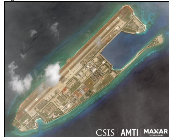
PRC Airfield on Fiery Cross Reef

Duterte-Era Relations. When Philippine President Rodrigo Duterte took office in 2016, he pledged to shift his country’s foreign policy away from the US — a longstanding treaty ally — in favor of China and Russia. On a trip to Beijing that year, he said that it was “time to say goodbye to Washington.” In Duterte’s view, the Philippines was not adequately benefitting from its relationship with the US, while a turn toward Beijing would yield long-term economic benefits in the form of investments as a part of China’s “Belt and Road” initiative. Chinese leadership used this political support as cover to accelerate its SCS agenda, especially in Philippine territorial waters. As it turns out, Duterte became disillusioned with China’s promises and pivoted back to a pro-US policy before his departure from office in 2022.