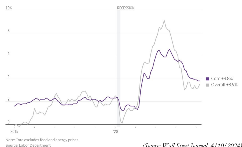
Figure 2 Consumer Price Index, Change From a Year Earlier