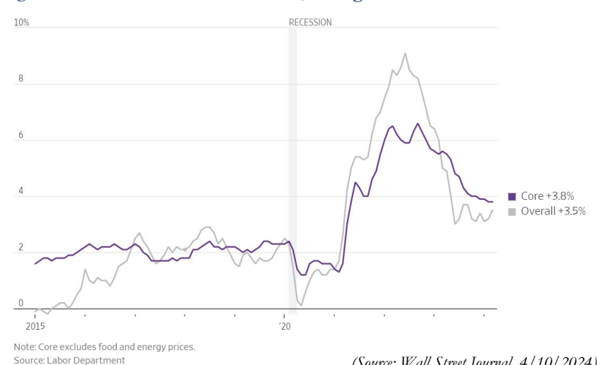
Figure 2 Consumer Price Index, Change From a Year Earlier