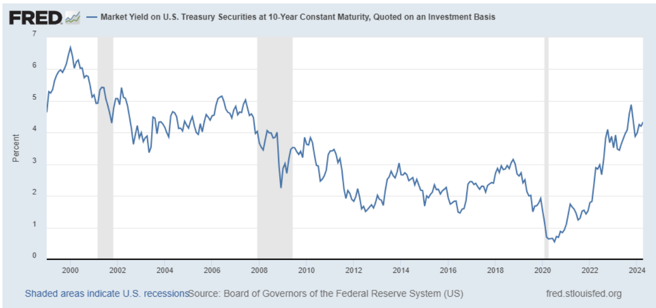
Figure 3 Market Yield on U.S. Treasury Securities at 10-Year Constant Maturity