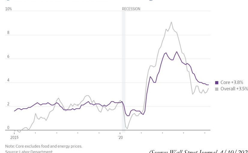
Consumer Price Index, Change From a Year Earlier