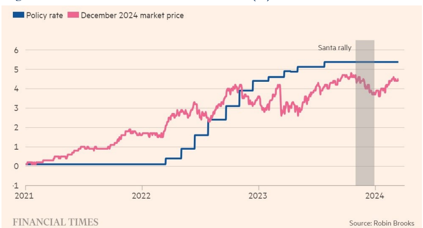
Figure 1 U.S. Interest Rate (%)

Unlike much of the past several years, recent returns have been broader-based. Both large caps and small caps, as measured by the Russell 1000 and 2000 indexes, respectively, are up approximately 30% off the October low. Although growth has outperformed value, the gap was much narrower than the recent past as Apple (AAPL) was up only 2% and Tesla (TSLA) posted a loss of 15.2%, which helped narrow the gap to “only” 5.3%, with the Russell 1000 Growth up 31.4% versus the Russell 1000 Value up 26.1%.